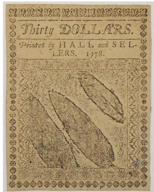
THREE WILLOW LEAVES

One important goal of HMPF is to continually try to publish little known and interesting historical facts concerning our early local, state and national history. We hope that our readers see the effort that is devoted to our publications and that they find them interesting and of value.